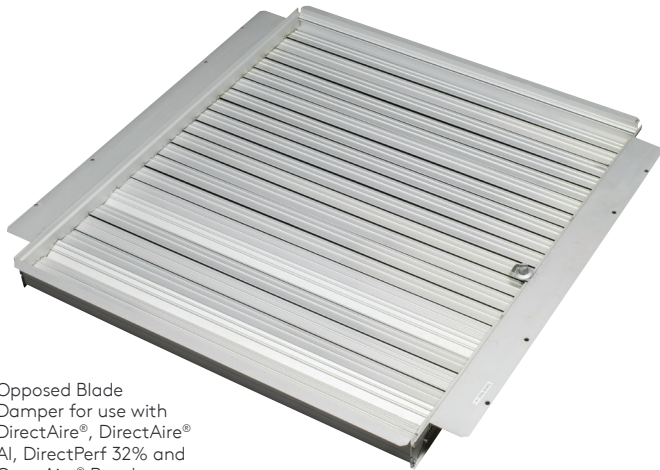
Opposed Blade Damper for use with DirectAire®, DirectAire® AI, DirectPerf 32% and GrateAire® Panels

Tate's Single-Zone Opposed Blade Damper offers a dramatic airflow improvement over traditional manual slide dampers. It features a nearly infinite range of adjustment and very little airflow resistance. Easy access through the panel's surface allows for quick adjustment of airflow balancing to IT hardware.