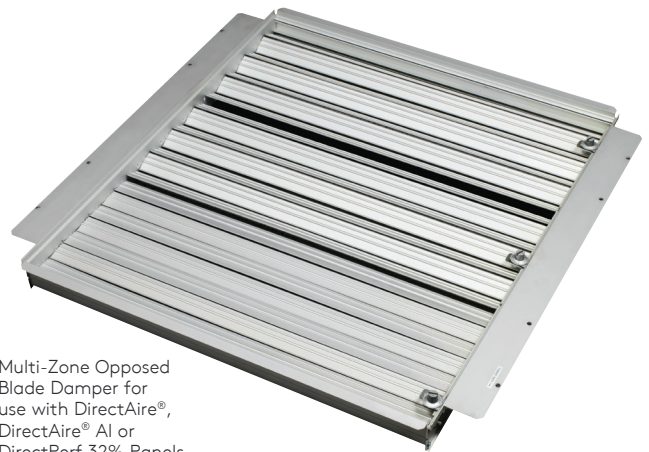
Multi-Zone Opposed Blade Damper for use with DirectAire®, DirectAire® AI or DirectPerf 32% Panels

Tate's Multi-Zone Opposed Blade Damper enables the airflow delivery to be balanced based on the specific load in the rack. The damper allows data center operators to individually adjust airflow to three zones within the rack – top, middle and bottom.