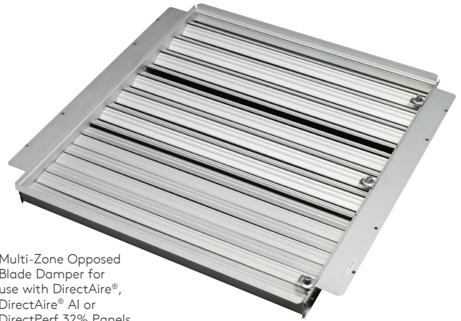
Multi-Zone Opposed Blade Damper for use with DirectAire®, DirectAire® AI or DirectPerf 32% Panels

Tate's Multi-Zone Opposed Blade Damper enables the airflow delivery to be balanced based on the specific load in the rack. The damper allows data center operators to individually adjust airflow to three zones within the rack – top, middle and bottom.