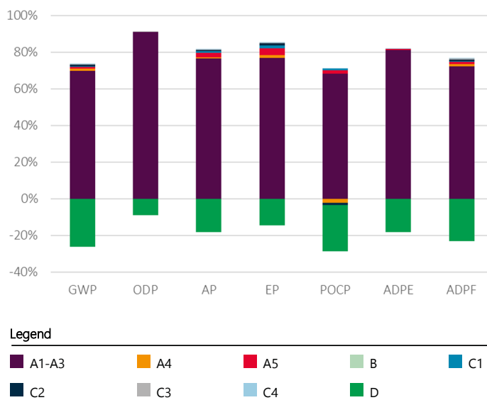
Figure 3 LCA results for the insulated wall panel

Module D values are largely derived using worldsteel's value of scrap methodology which is based upon many steel plants worldwide, including both BF/BOF and EAF steel production routes. At end-of-life, the recovered steel profiles are modelled with a credit given as if they were re-melted in an Electric Arc Furnace and substituted by the same amount of steel produced in a Blast Furnace [21] . This contributes a significant reduction to most of the environmental impact category results, with the specific emissions that represent the burden in A1-A3, essentially the same as those responsible for the impact reductions in Module D.