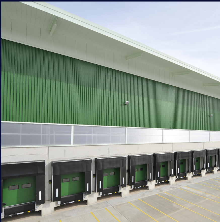
Kingspan Day-Lite Architectural KS1000 DLAWP