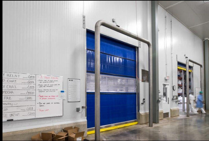
Wall Product KS Shadowline KS45 Shadowline Interior

Kingspan's KS Shadowline and KS45 Shadowline Interior insulated metal panels were selected to help to achieve the project directive to have all work completed without disrupting current operations, as well as providing an improved high level of thermal performance.