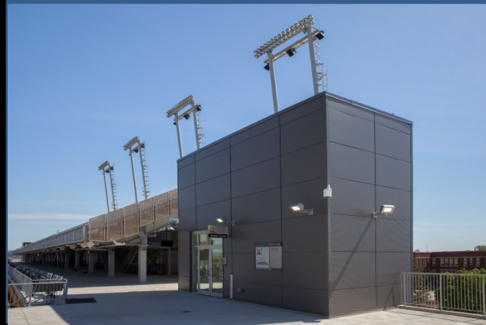
Wall Product KS Micro-Rib

The end result was a stadium fit for both FIFA and CFL requirements – and with the help of this panel system, the brand new stadium went on to achieve a LEED Silver certification.